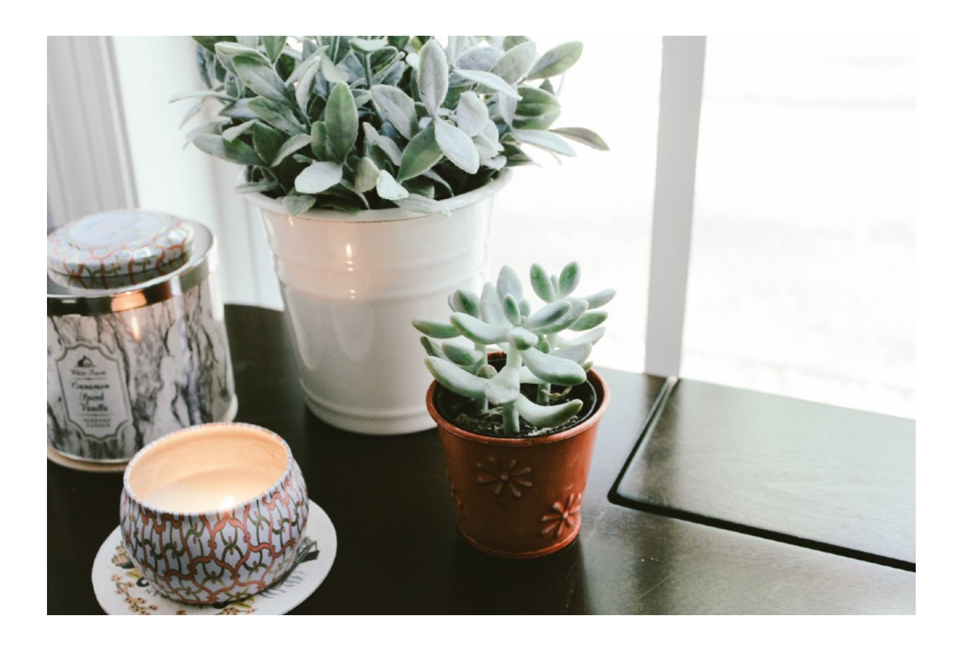
Slow Down & Tune In | Connie Chapman 2018

It can also be a place where you connect with your dreams and desires, so you may want a vision board there with inspiring images and words, or you may want to keep it very simple so it is just a nice calm space for you to visit.